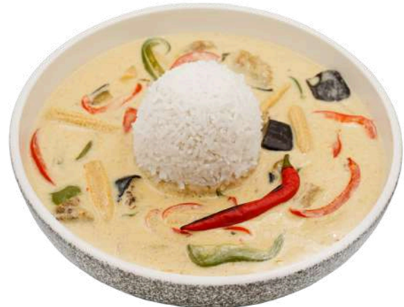
Thai Green Curry

Risotto Rice, Prawns, Parmigiano Reggiano, Green Peas, Cherry Tomato, Paprika