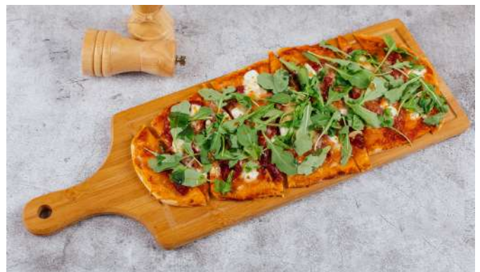
Bresaola & Goat Cheese

Homemade Dough, Avocado, Black Olives, Cherry Tomato, Onions, Balsamic Glaze