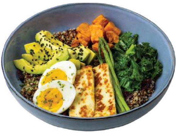
Grilled Halloumi Breakfast

Halloumi, Asparagus, Avocado, Kale, Sweet Potato, Egg, Mix Quinoa, Dried Cranberry, Sesame Seeds.