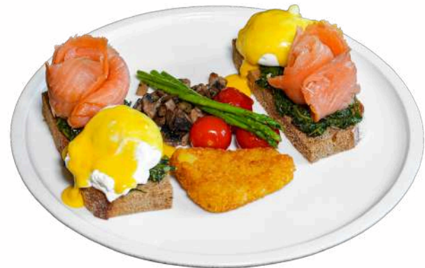
Royale Eggs Benedict

Croissant Plain, Assorted Baguettes, Jam, Honey, Butter, Feta Cheese