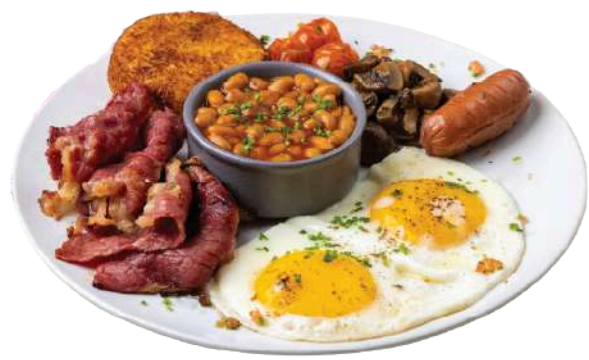
An English in Dubai