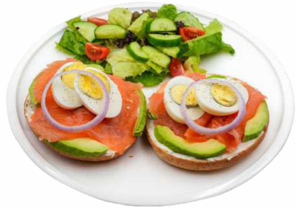
Breakfast on Bagel

Wholemeal Bagel, Cream Cheese, Avocado Smoked Salmon, Egg's Your Way, Onion Rings and Side Salad