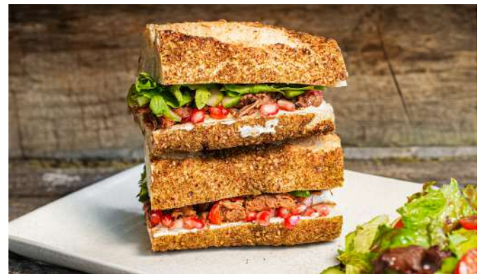
Lamb of Arabia