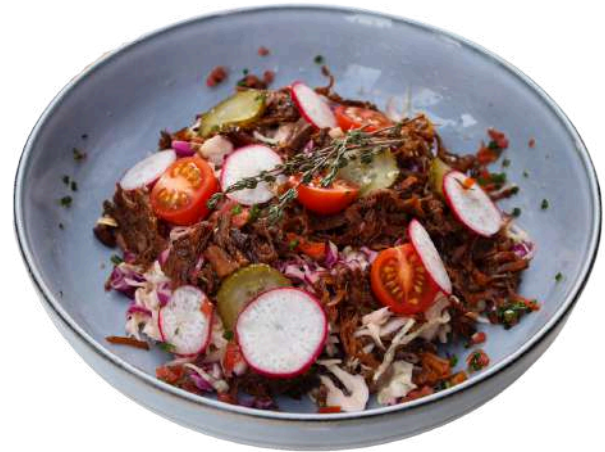
Lean Beef Brisket ( Keto )