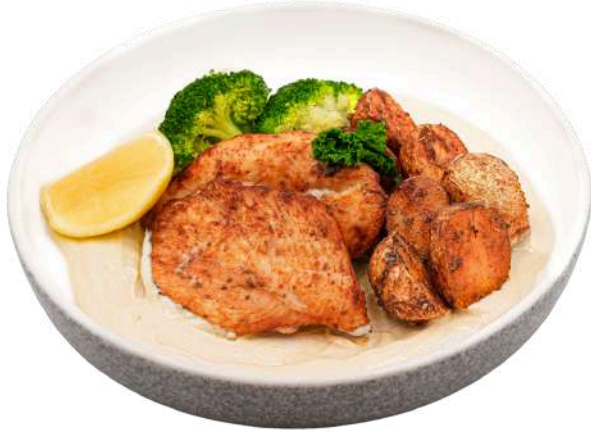
Grilled Chicken Bowl

Marinated Grilled Chicken Breast, Baked Baby Potato, Broccoli, Tahina Sauce, Lemon Wedge