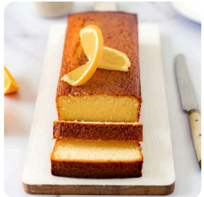
Orange Cake Gluten Free