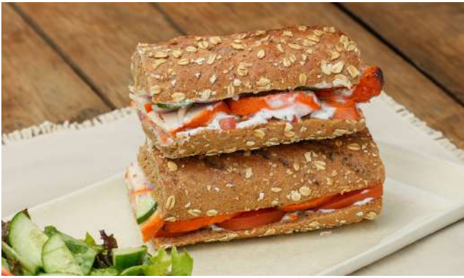
The Tandoor Sizzler by Tazo

Rye Bread, Egg, Chicken, Turkey Ham, Cheddar Cheese, Lettuce, Tomato, Mayonnaise, Side Salad