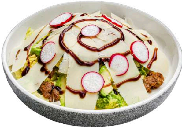
Steak & Avocado ( Keto )

Tenderloin Steak, Baby Gem Lettuce, Avocado, Red Radish, Parmesan Cheese, Horse Radish Dressing