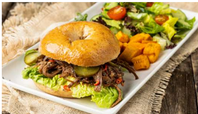
Lean Beef Brisket