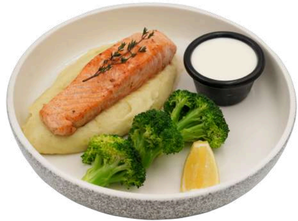
King Grilled Salmon