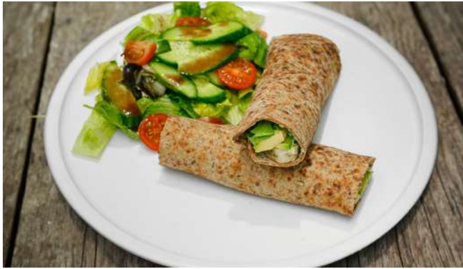
Chicken Avo Wrap