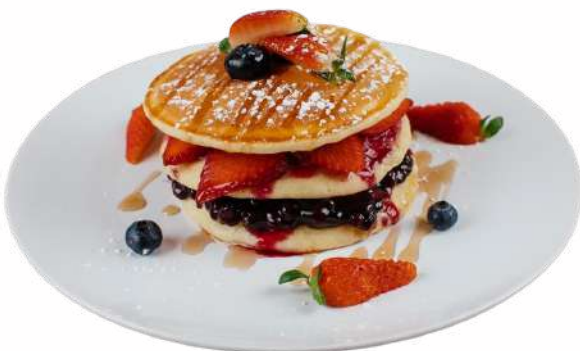
Berries & Maple Syrup Pancake