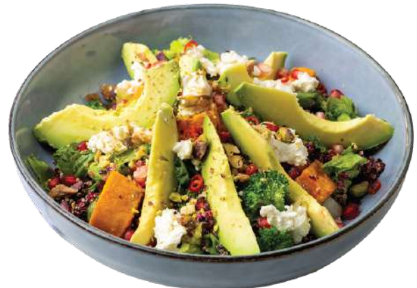
Super Food with a Kick

Avocado, Kale, Quinoa, Broccoli, Sweet Potato, Feta Cheese, Pomegranate Seeds, Nuts, Fresh Chilli, Pomegranate Dressing